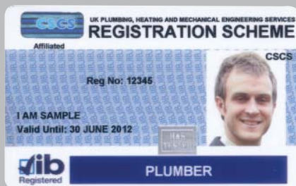
New UK-PHMES Registration Scheme Card

As from 2nd February 2009 , the UK-PHMES CSCS Registration Scheme Card will be introduced to implement the joint UK Plumbing, Heating & Mechanical Engineering Services CSCS affiliated Registration Scheme. Examples of the new and the existing card designs are shown below.